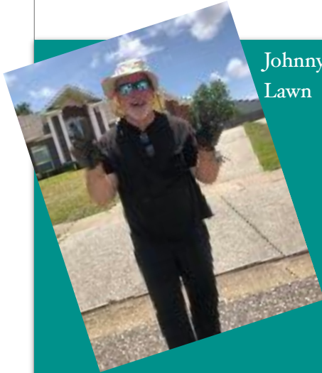
Johnny's Lawn Care