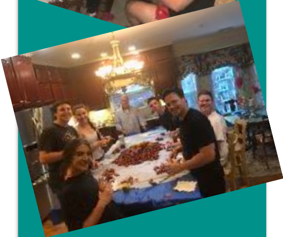
Our first harvest from the garden we planted at the beginning of quarantine!