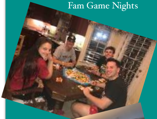
Fam Game Nights