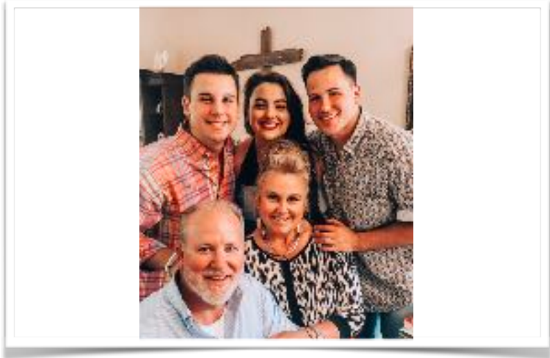
(Above and in left column: Celebrating Mother's Day 2020. One good thing about a pandemic having ALL of our children together! )

Dear Ministry Partners, Family and Friends,